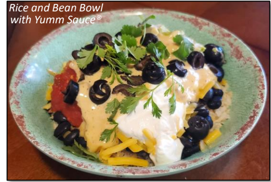
Rice and Bean Bowl with Yumm Sauce®