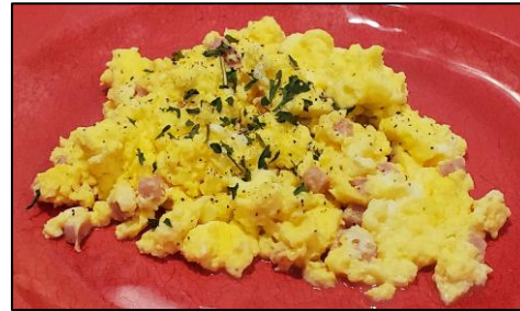
Scrambled eggs with Diced Ham & shredded Tillamook® Cheddar Cheese

Eggs Only $7, Eggs with Cheese $8, Eggs with Diced Ham & Cheese $9