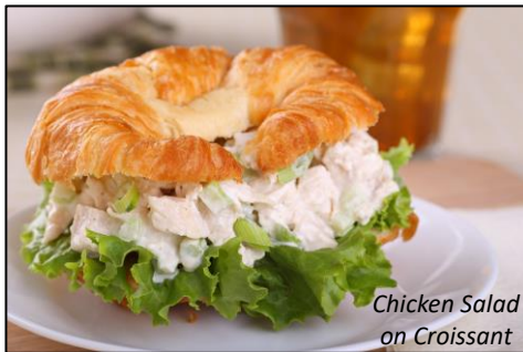
Chicken Salad on Croissant