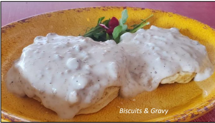
Biscuits & Gravy