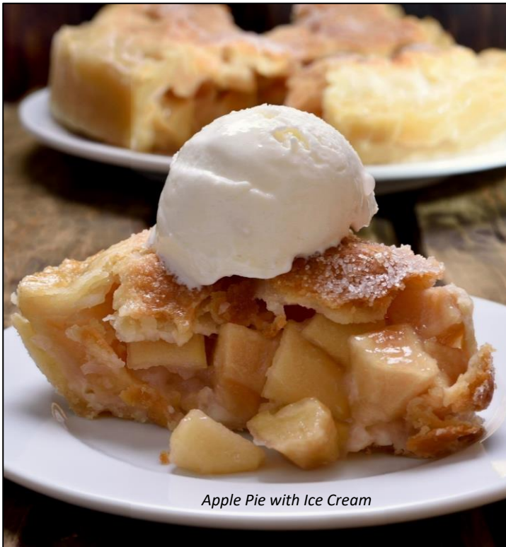
Apple Pie with Ice Cream