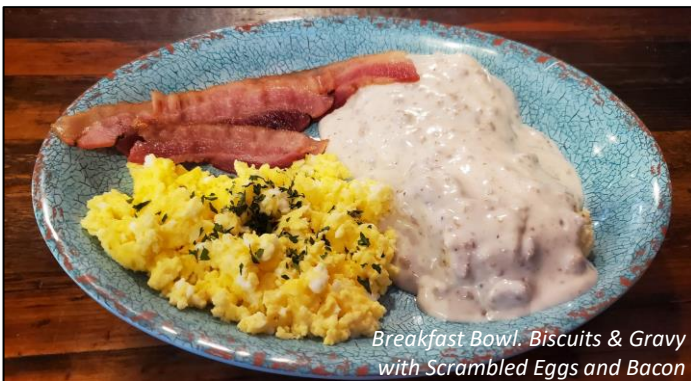
Breakfast Bowl. Biscuits & Gravy with Scrambled Eggs and Bacon

Granola Bowl. Oat, honey, raisin, and almond granola with fresh blueberries.