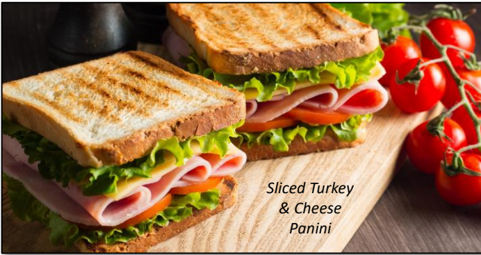
Sliced Turkey & Cheese Panini