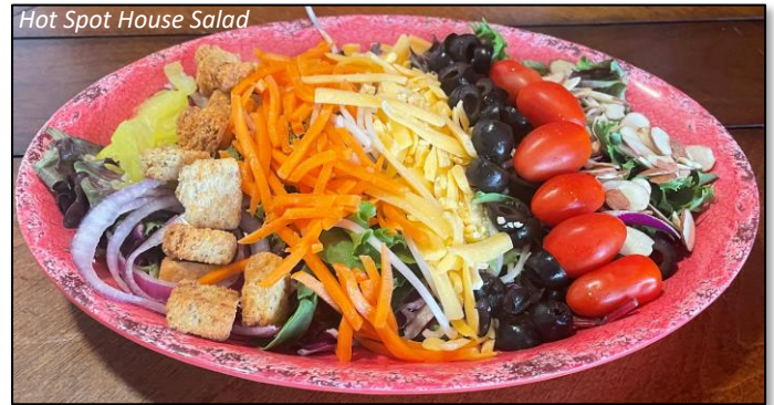
Hot Spot House Salad