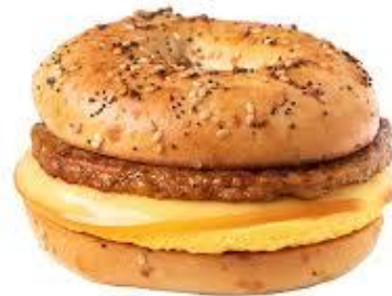
Breakfast Sandwich with Scrambled Eggs and Sausage Patty on Everything Bagel

1 Bagel flavors include Plain, Cinnamon Raisin, or Everything